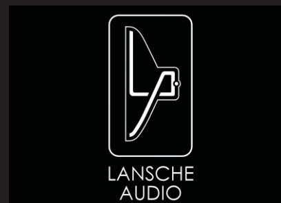
Model 8.2 Reference Loudspeakers